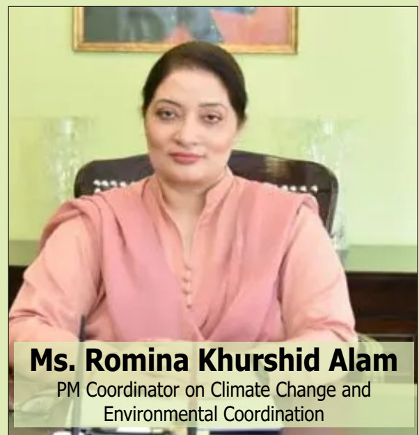
Ms. Romina Khurshid Alam

This analysis by Romina Khurshid Alam, the PM's coordinator on climate change and environmental coordination, highlights how the global climate crisis is significantly impacting nutrition in developing countries like Pakistan. Disrupted weather patterns are affecting crop yields and nutritional quality, leading to food shortages and malnutrition. Regions in East Africa and Southeast Asia are experiencing reductions in staple crops, resulting in micronutrient deficiencies and health issues. Coastal communities in South Asia are further challenged by rising sea levels and cyclones, exacerbating food insecurity. To combat this silent crisis, coordinated global efforts are essential to implement climate-resilient agricultural practices and ensure equitable access to nutritious food.