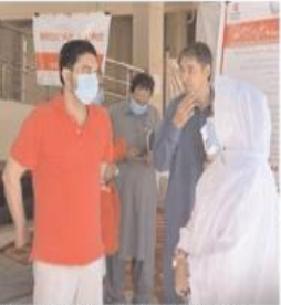
33 million people including 16 million children have been severely affected by the devastating floods in 106 districts across the four provinces. The floods have also damaged 23,000 schools, 148 health facilities, and 12,000 km of

literally play space where first flood-affected children can and their anxiety through gaming activities," he said. Rosana Nuez Saadi further added that "flood-affected areas in the flooded district of Santa Fe de Chikita in Mérida, Yucatán, the international humanitarian organization Save the Children has pledged to provide NFI kits, dignity kits and other necessary relief items in addition to visits to the schools of the district." He revealed that Save the Children has also established a mental health center in Espinal, Mérida, where over 100 children, including female and professional staff are providing health care to about 400 patients daily along with provision of the medicines. "We have also arranged a psychosocial health center who is counseling children get out of the traumatic stage of flood disasters," he said. The latest figures show the