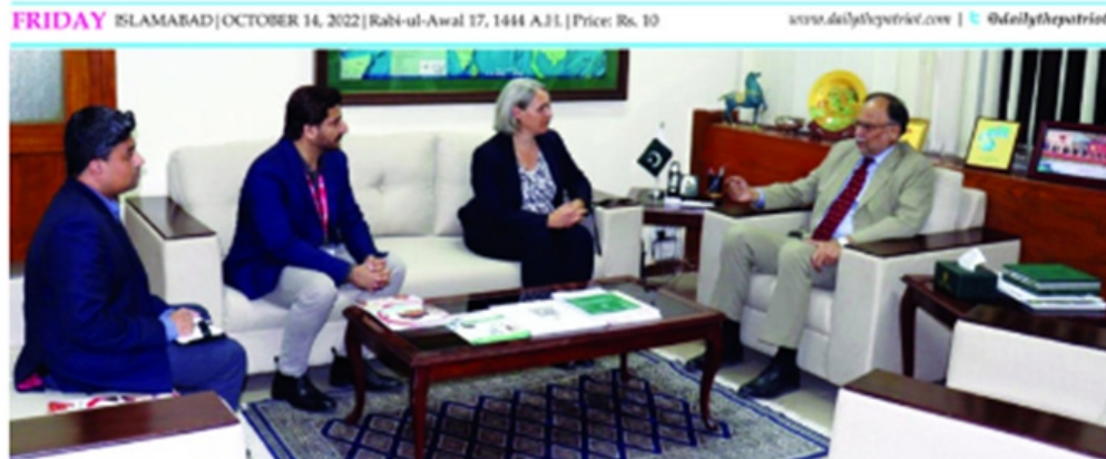
Women to play vital role in rehabilitation, reconstruction process: Ahsan Iqbal